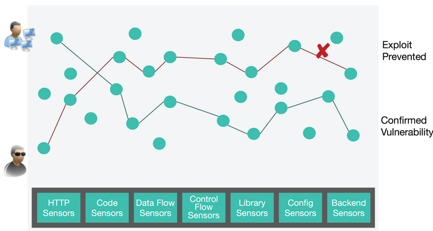
Figure 1. How the Contrast agent works in your application

Contrast Security's unique patented instrumentation enables our agent to perform attack detection & response with more insight, at a deeper level than other solutions. We take a seven-step approach that is more robust and comprehensive, to improve the likelihood of blocking zero-day attacks and detecting probe attempts.